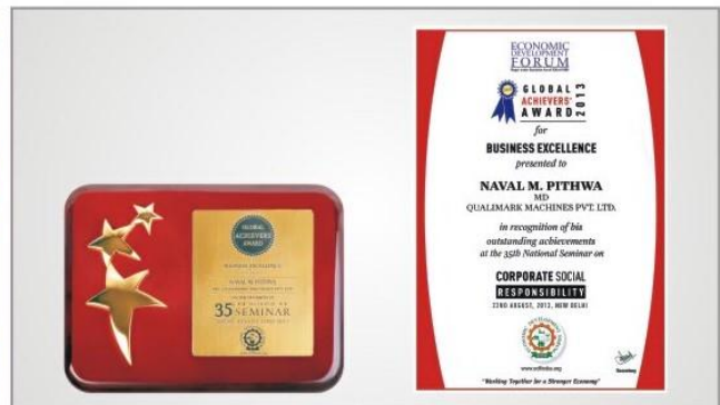
Qualimark has been awarded the renowned ' Global Achievers Award ' for Business Excellence Category in 35th Indian Achiever's Summit 2013.